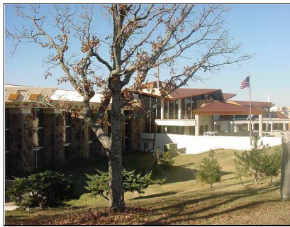
Narconon Arrowhead drug and alcohol rehabilitation center. A new, proven approach to drug rehabilitation.